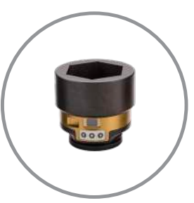
INCLUDED 12K & 18K* SMART SOCKETS™